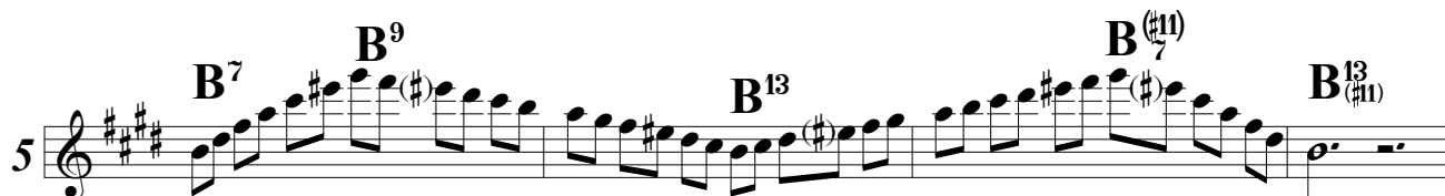
Jazz minor a fifth above