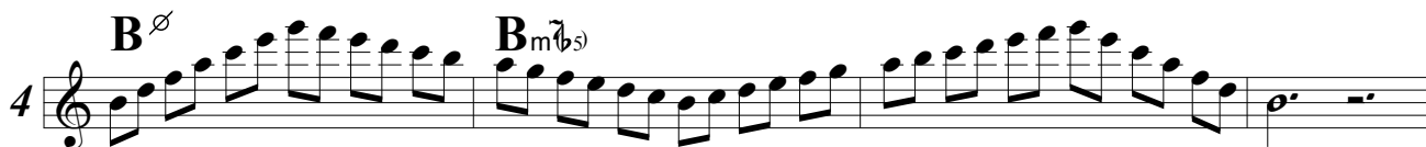
Locrian, or major a semi tone above