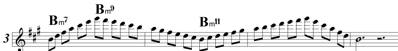
Dorian, or major a tone below