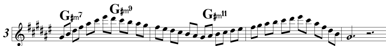
Dorian, or major a tone below