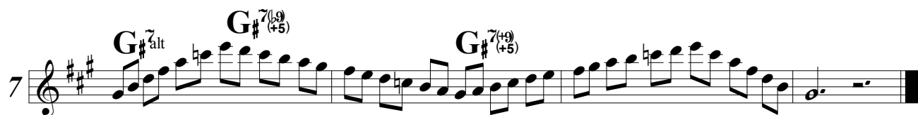
Altered, or jazz minor a semi tone above