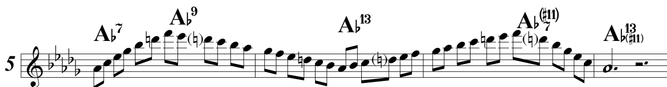
Jazz minor a fifth above