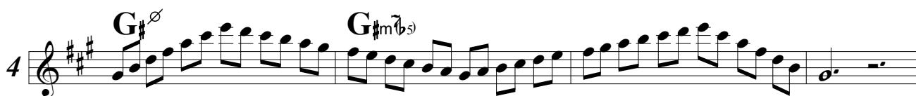
Locrian, or major a semi tone above