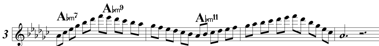
Dorian, or major a tone below