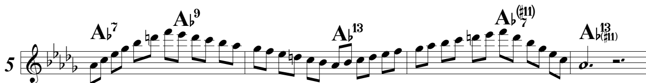
Jazz minor a fifth above