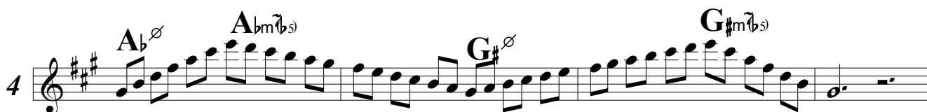
Locrian, or major a semi tone above