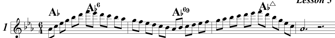
Lydian, or major a fifth above