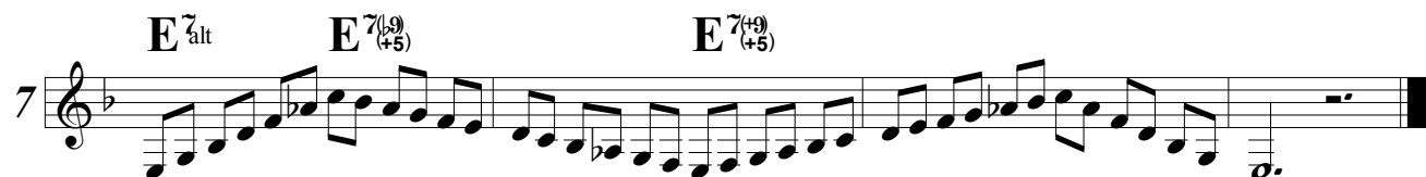
Altered, or jazz minor a semi tone above