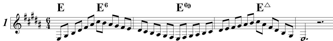
Lydian, or major a fifth above