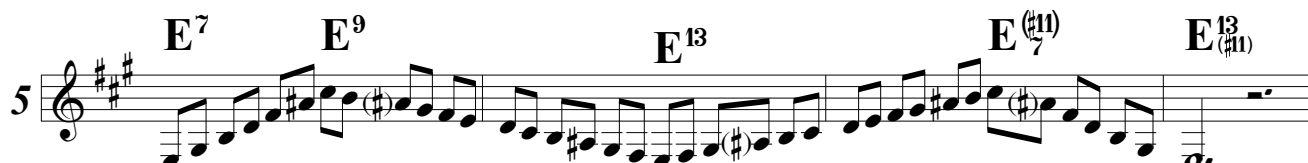
Jazz minor a fifth above