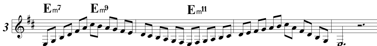
Dorian, or major a tone below