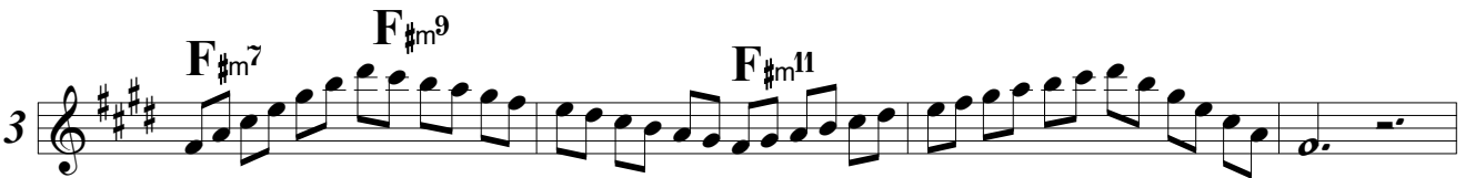
Dorian, or major a tone below