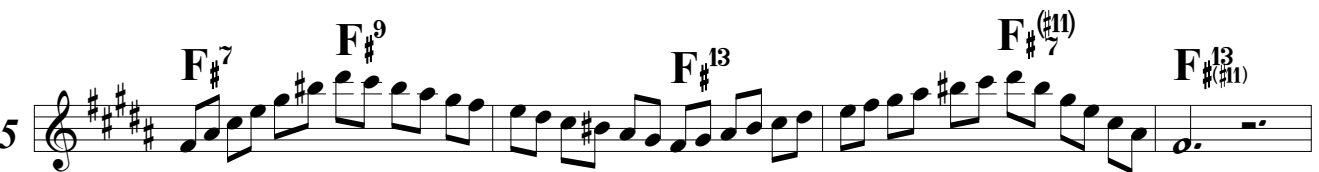
Jazz minor a fifth above