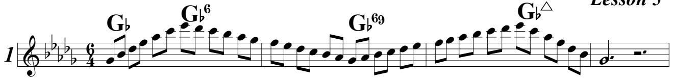
Lydian, or major a fifth above