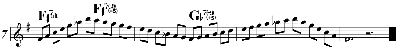
Altered, or jazz minor a semi tone above